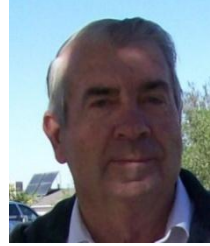
Sherwin WB7NFX NCS

147.000 Repeater Sunday nights at 8:00 PM