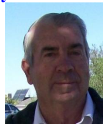
Sherwin WB7NFX NCS