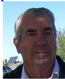
Sherwin WB7NFX NCS

The Prescott Area Mercury Net is still plugging along, gaining and losing as we go. We are planning some exercises to work on emergency preparedness and procedures.