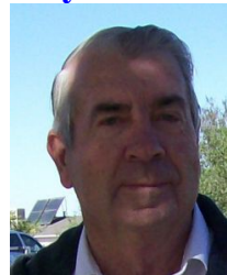
Sherwin WB7NFX NCS