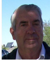
Sherwin WB7NFX NCS